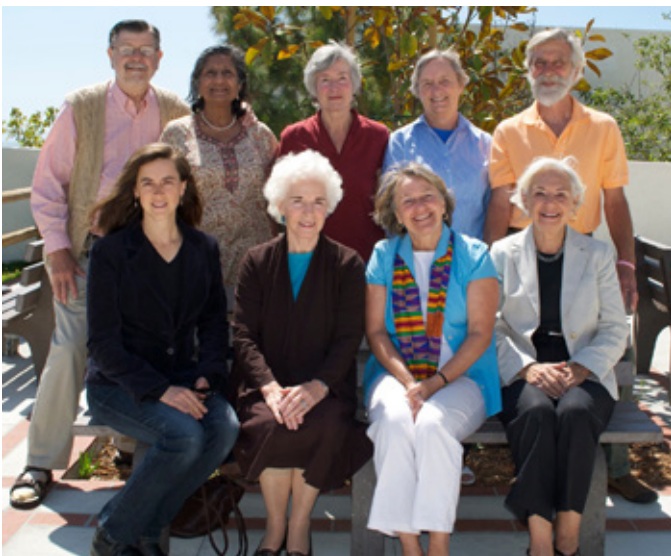
The CGD Board

Currently, the CGD has 12 Board members, a majority of whom are women. I joined the CGD in the Fall of 2011 and currently I am treasurer. The CGD's programs are a great place to educate myself while educating our community.